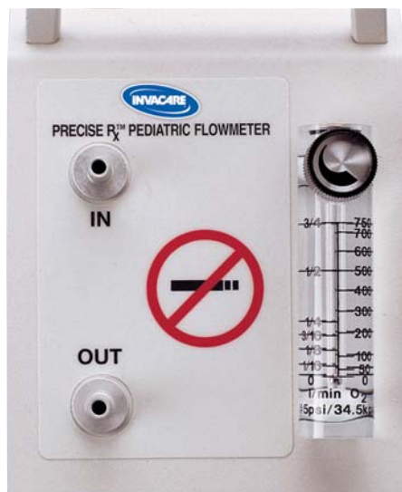
Detail of Invacare PreciseRx pediatric flowmeter.